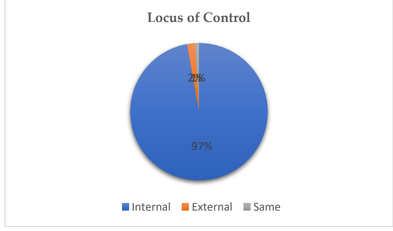
Figure 1. Percentage of Student Locus of Control

After distributing the questionnaire, the results were obtained and the data was processed using the percentage method of the Guttman scale questionnaire. The description of locus of control analysis in the selection of further student studies as a whole based on data obtained in the field by distributing locus of control questionnaires can be seen in Figure 1.